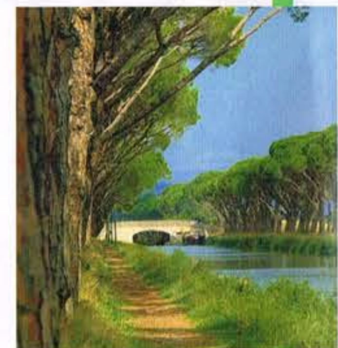
From top: the Chateau's brasserie; view from the terrace; the Canal du Midi

Lead-in rates from £195 per night (based on two people sharing for a three to six-night stay) for accommodation in a Chateau Suite. Prices valid June 29 to September 2, 2012.