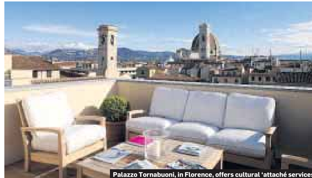
Palazzo Tornabuoni, in Florence, offers cultural 'attaché services'