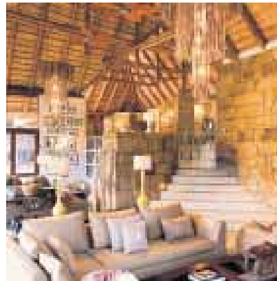
Track leopards at the Phinda reserve, in South Africa, where luxury eco-lodges start at £3.8m