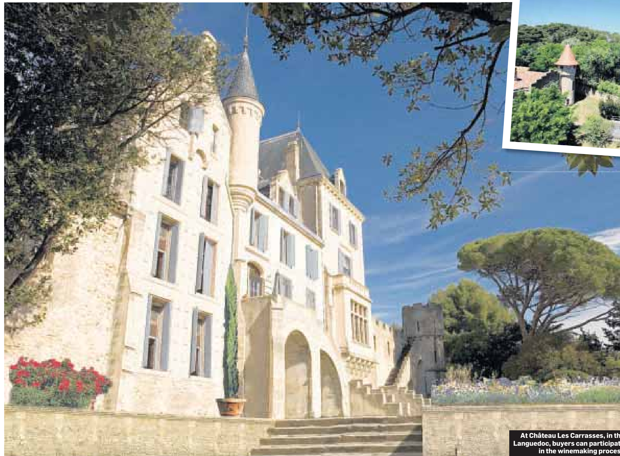
At Château Les Carrasses, in the Languedoc, buyers can participate in the winemaking process

More organic experiences are in store for buyers at La Masseria, in Puglia, southern Italy, where you can buy a five-acre plot on which local craftsmen will construct a bespoke stone farmhouse. Prices, including building, start at about £640,000. "You are free to grow your own fruit, vegetables, olives and grapes, or, if you would rather enjoy the fruits without the labour, you can sign up to a scheme where local