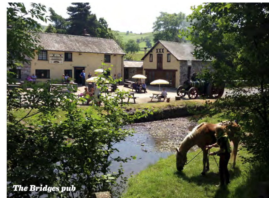
The Bridges pub

Just out of town is the Ludlow Food Centre (ludlowfoodcentre.co.uk), an earnest if slightly sterile showcase for the county's produce. We've had enough booze cruising, we decide. Instead we stock up here on everything we need to make slow-baked sausages in the Aga (including a bottle of Postman's Knock rich ruby porter from another local brewery, Hobsons) and head back to our country idyll. ☺