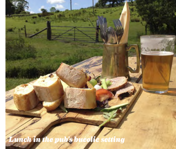
Lunch in the pub's bucolic setting

Little Cwm Colebatch sleeps 6; rental costs from £785 for 3 nights (sheepskinlife.com). olive offer: Book 4 nights and receive 10% off a stay at any Sheepskin property. Standard T&Cs apply. Book by 31 October, valid until 31 January 2015. Please quote olive magazine when booking