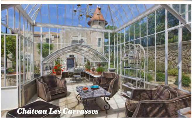
Château Les Carrasses