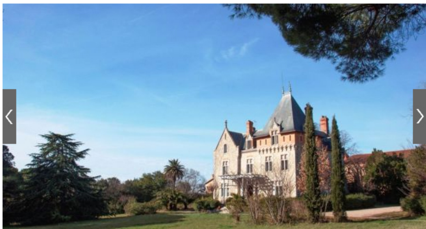
Château St Pierre de Serjac

Creating luxury holiday retreats in crumbling French wine châteaux may be old hat to one Irishman – now the idea is catching on